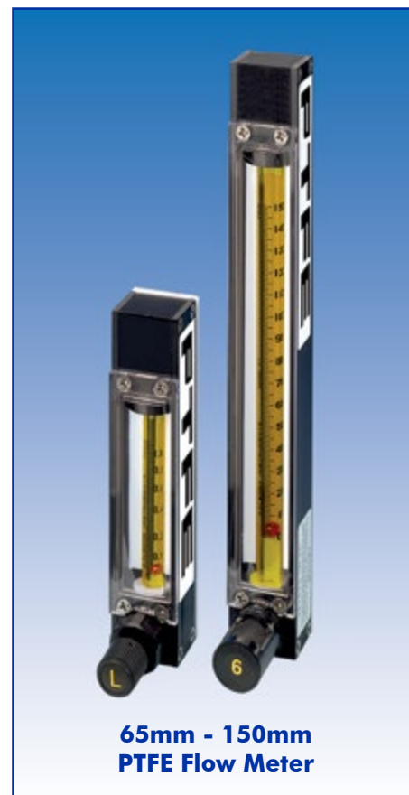
65mm - 150mm PTFE Flow Meter

The unique design combines the rigidity of an aluminum structural frame with the desirable chemical inertness of PTFE components. Uses standard 65mm and 150mm flow tubes. Meters are equipped with built-in PTFE needle valves with Kel-F® valve spindles. Valves may be positioned either at inlet or outlet side of flow meter.