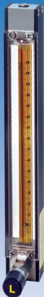
Brass 150mm Flow Meter with CV™ valve

CV™ Valve Cartridges are designed for adjusting flow rates in applications where high resolution metering regulation is not essential.