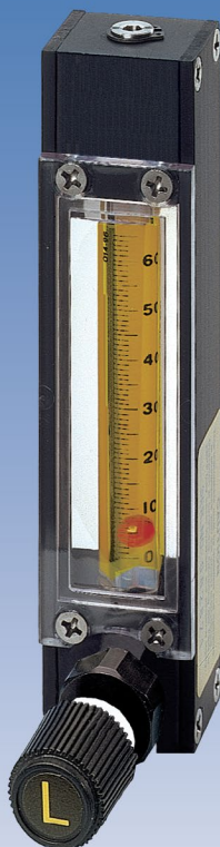
Aluminum 65mm Flow Meter with CV™ Valve

CV™ Valve Cartridges are designed for adjusting flow rates in applications where high resolution metering regulation is not essential.