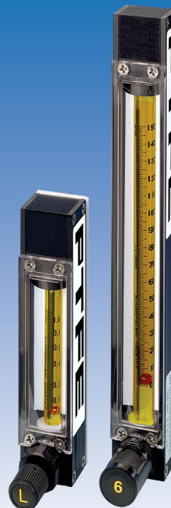
65mm - 150mm PTFE Flow Meter

NOTE: NUMBERS IN BRACKETS ARE IN MILLIMETERS