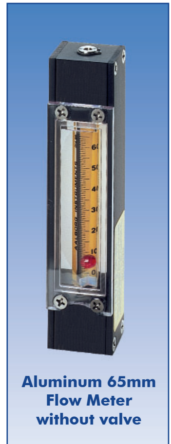
Aluminum 65mm Flow Meter without valve

For Materials of Construction see page 16