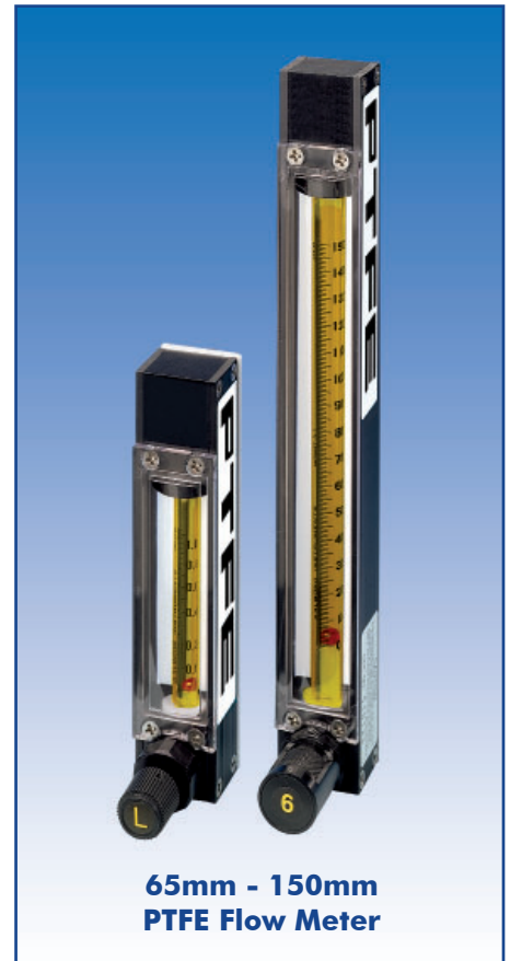
65mm - 150mm PTFE Flow Meter